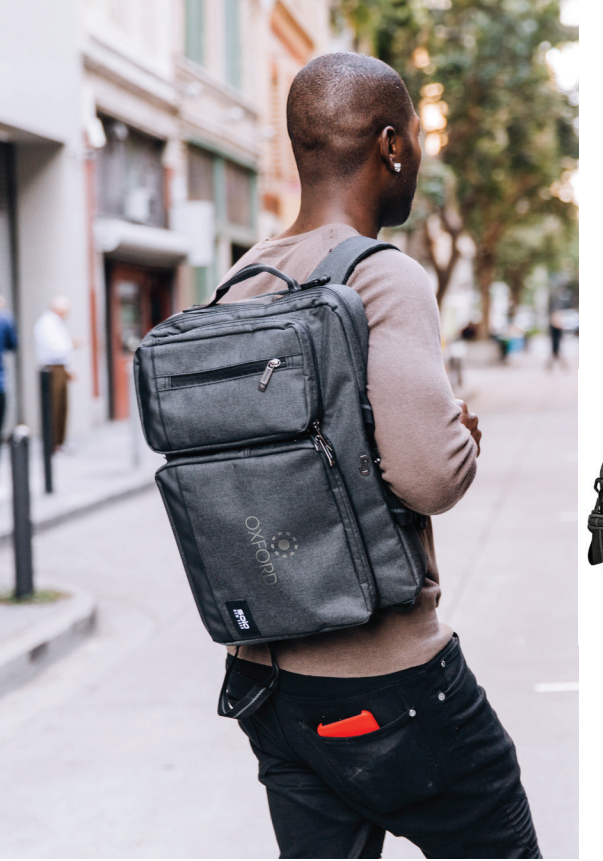
KC1804 SOLO NY® DUANE HYBRID BRIEFCASE