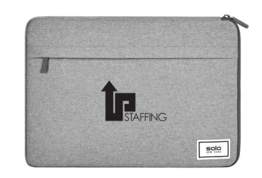
KL0010 SOLO NY® RE:FOCUS 15.6" SLEEVE