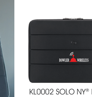
KL0002 SOLO NY® BOND 15.6" SLEEVE