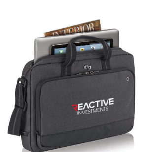
KL1015 SOLO NY® ASTOR SLIM BRIEF