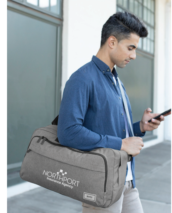
KL5015 SOLO NY® RE:MOVE DUFFEL