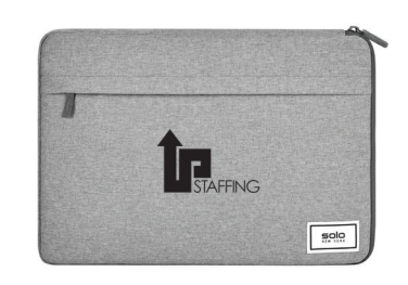
KL0010 SOLO NY® RE:FOCUS 15.6" SLEEVE