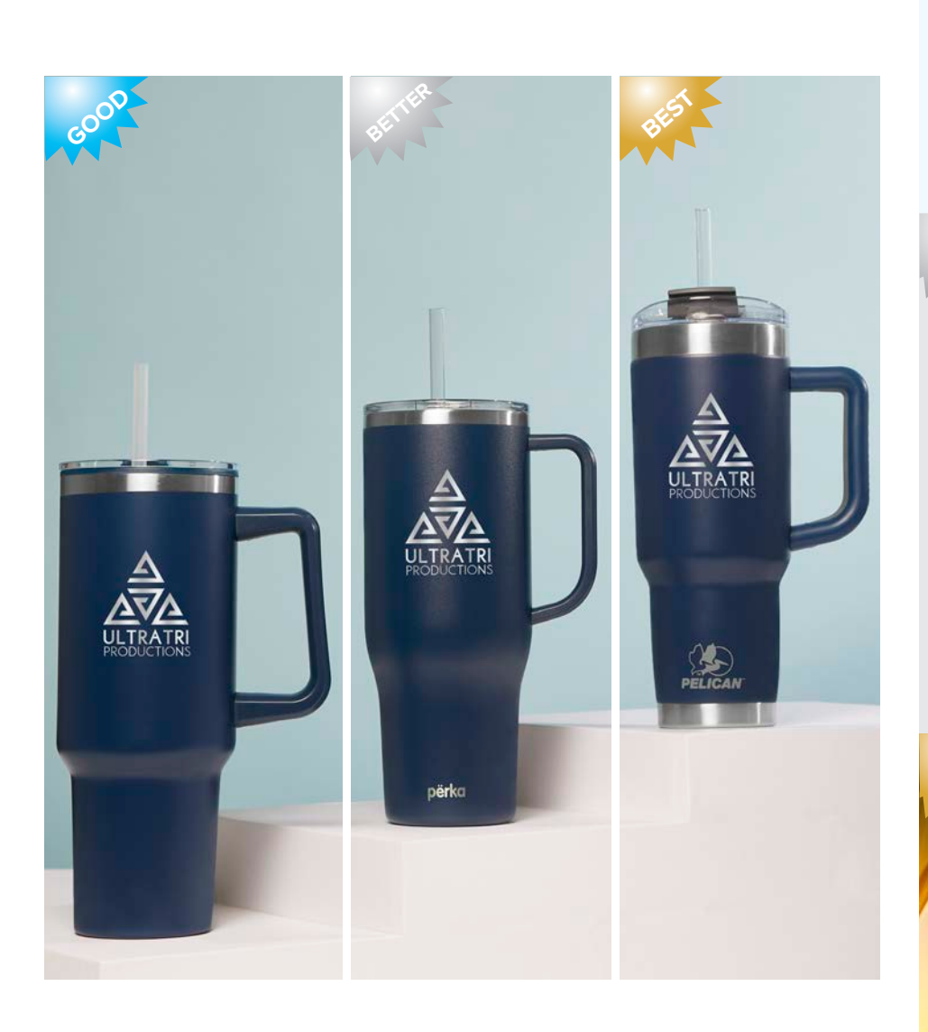
GOOD | BETTER | BEST Vol. 1