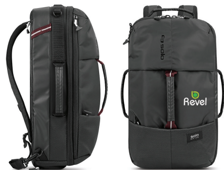
KL5010 ALL-STAR BACKPACK DUFFEL