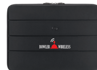
KL0002 SOLO NY® BOND 15.6" SLEEVE