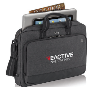
KL1015 SOLO NY® ASTOR SLIM BRIEF