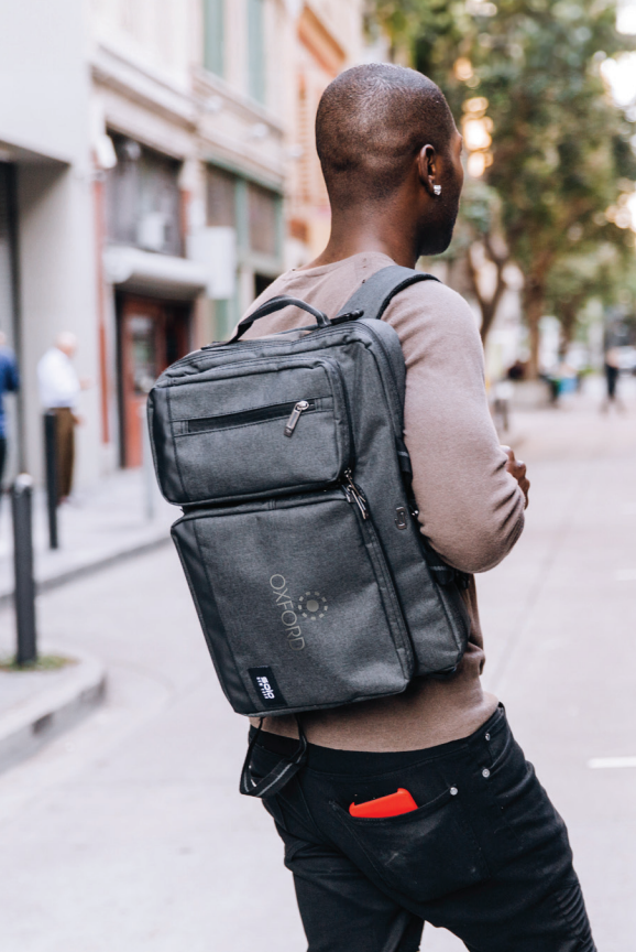
KC1804 SOLO NY® DUANE HYBRID BRIEFCASE