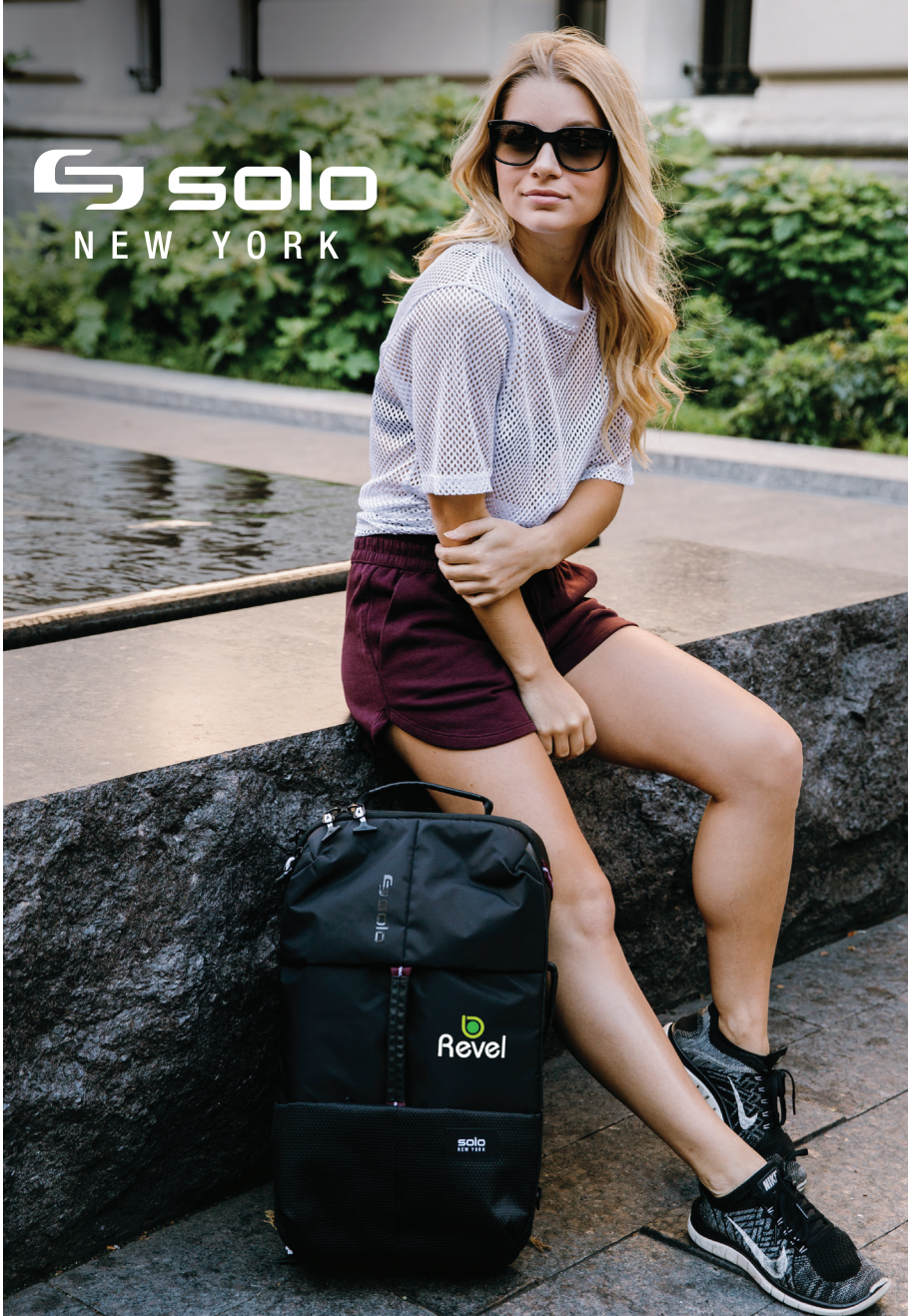
SOLO NEW YORK