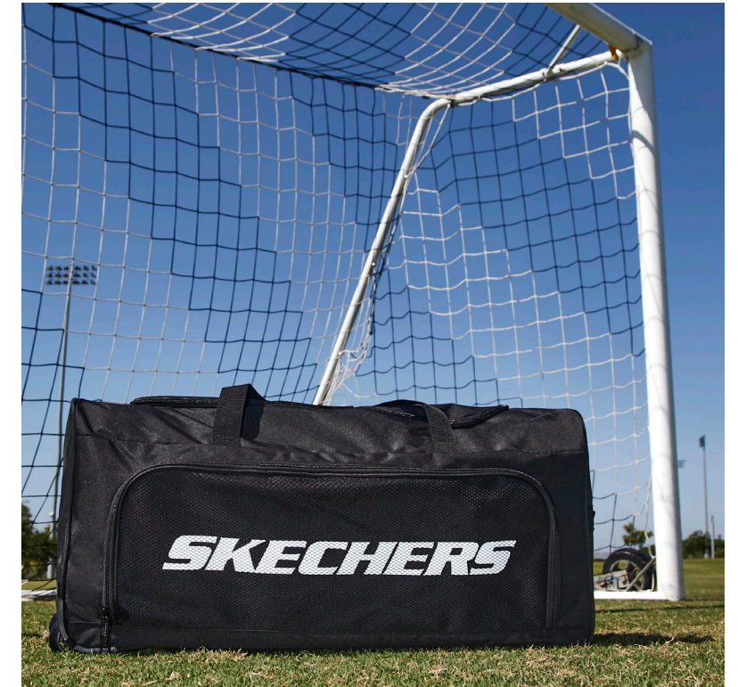
GILLETTE 30" WHEELED DUFFEL

KS8400 SKECHERS™ GILLETTE 30" WHEELED DUFFEL