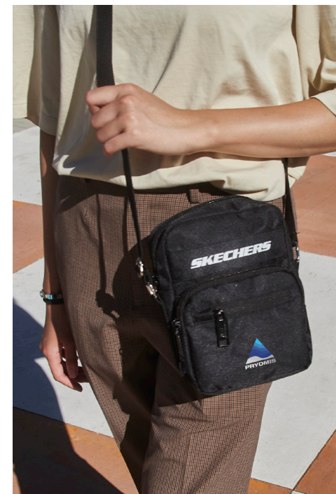
HATCH CROSSBODY BAG