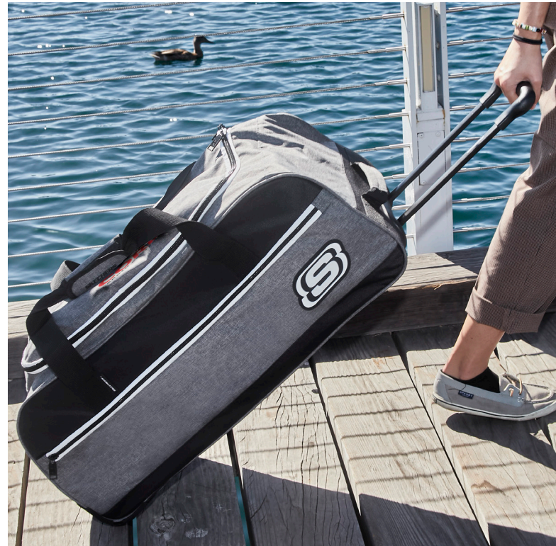
SARATOGA 28" WHEELED DUFFEL

KS8401 SKECHERS™ SARATOGA 28" WHEELED DUFFEL