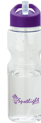
KW2703 AURORA 24 OZ. TRITAN™ WATER BOTTLE