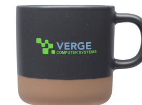
KM2904 TANZANIA 12 OZ. CERAMIC MUG