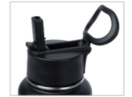
CH2020 HURLEY® OASIS 32 OZ. VACUUM INSULATED WATER BOTTLE W/ STRAW