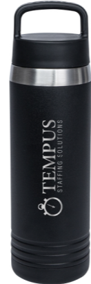
CG2002 IGLOO® 24 OZ. VACUUM INSULATED BOTTLE