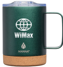
CM1012 MANNA™ BEACON 13 OZ. VACUUM INSULATED CAMPING MUG