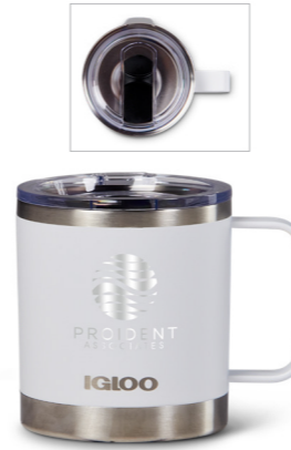
CG1006 IGLOO® 13.5 OZ. VACUUM INSULATED CAMPING MUG