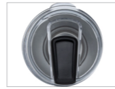
CG1001 IGLOO® 20 OZ. VACUUM INSULATED TUMBLER