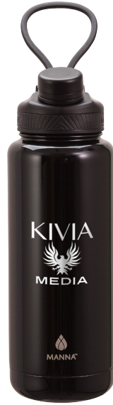
CM2028 MANNA™ OASIS 18 OZ. STAINLESS STEEL WATER BOTTLE W/ MARBLE LID