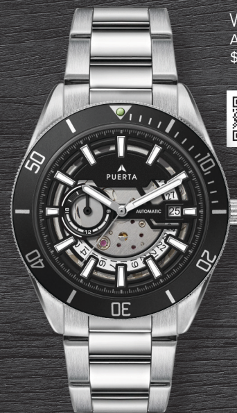
WC8240 As low as: $245.95 c