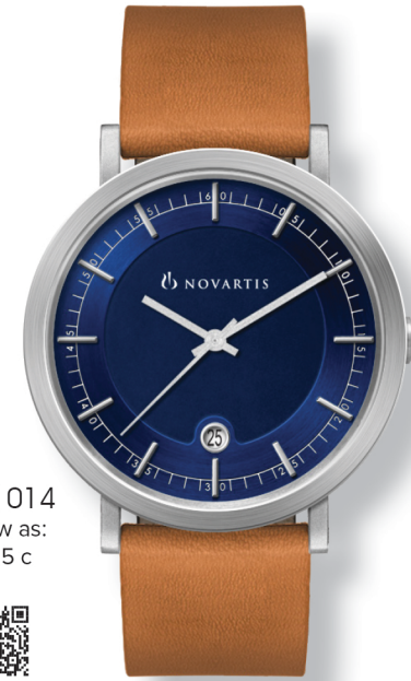
WC1014 As low as: $97.95 c