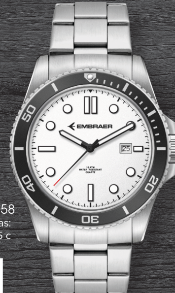
WC5258 As low as: $1115.95 c