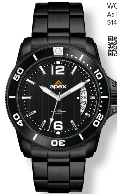
WC5016 As low as: $140.95 c