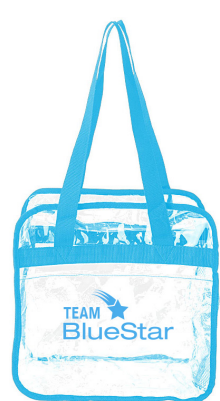
INLINE CUSTOM #1