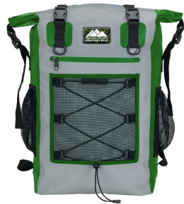
INLINE CUSTOM #1