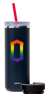
INLINE CUSTOM #1